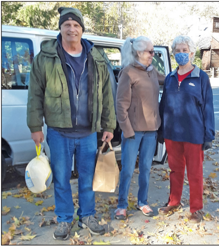
Volunteers with Trinity Congregational UCC Church/Weaverville Community Food Cupboard deliver Thanksgiving meals.