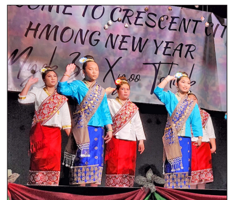
Hmong youth perform dances in traditional costumes during New Year celebration in Crescent City.

About 90 Hmong families call Del Norte County home. They're relatives of