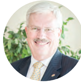
William Follett DEL NORTE COUNTY SUPERIOR COURT JUDGE