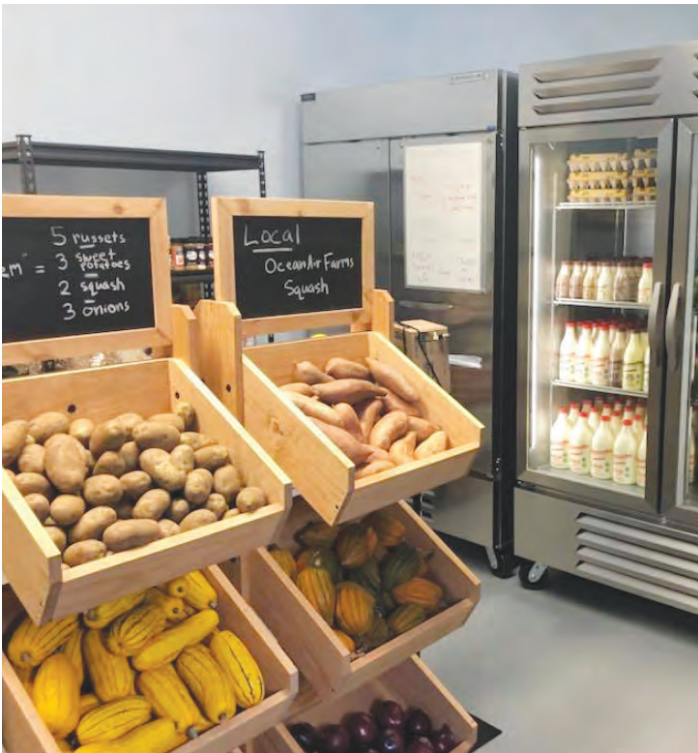
Fresh produce and dairy products at Pacific Pantry in Crescent City are provided by local agricultural businesses.

For more info or for how to get involved call 707-464-0955.