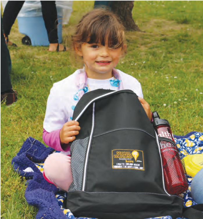
A Crescent City preschool student receives a BHC backpack filled with school readiness supplies and resources.

Putting children on the path to success!